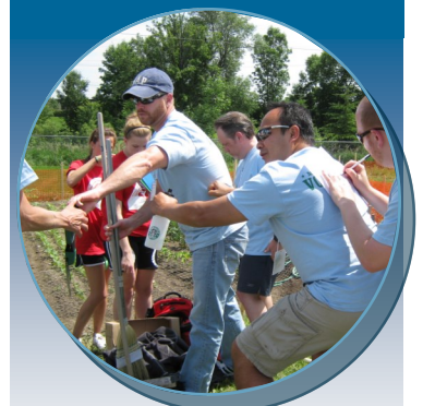
Starbucks, United Way with NROCRC at Nepean Community Garden 2010