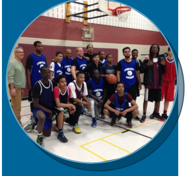
Top: Trillium Foundation Launch