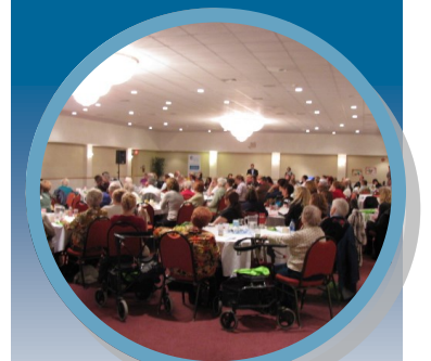
Strength of Seniors Conference 2011