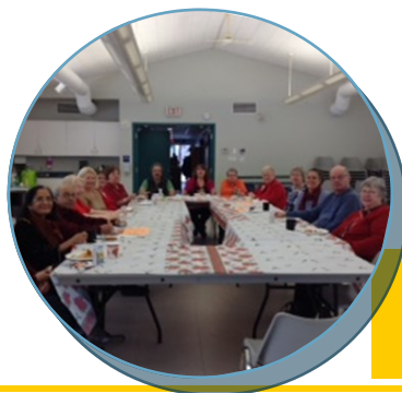
Tanglewood 'Young at Hearts' Group