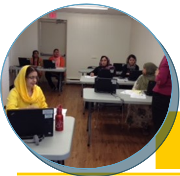
iSisters Technology Mentoring-Computer Program