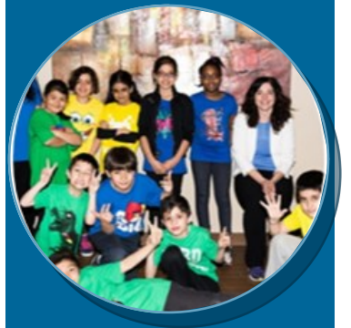
Parkwood Hills After School Kids Club Zumba performers-Shine a Light on our Youth 2015