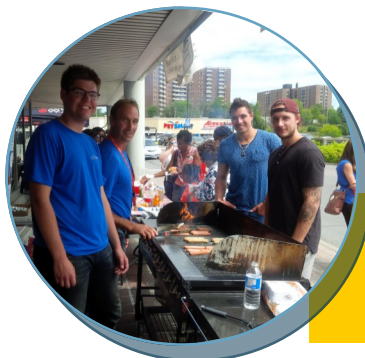
Tools 4 School BBQ with Boston Bruins-Ryan Spooner and Ottawa Senators-Cody Ceci